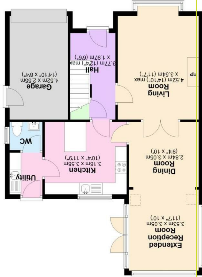
Approx. 73.1 sq. metres (786.6 sq. feet)

Total area: approx. 135.1 sq. metres (1454.7 sq. feet)