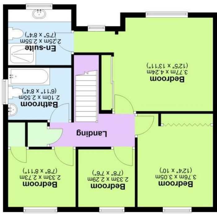
Approx. 62.1 sq. metres (668.1 sq. feet)